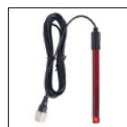
Redox probe kit as standard