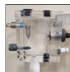
Free amperometric probe