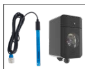
pH kit as standard