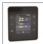
Detachable TFT screen