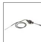
Flow switch included