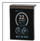
Detachable touch screen