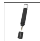
Free chlorine membrane probe